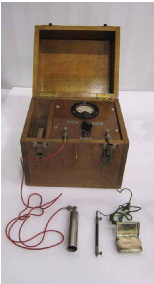
Battery powered monopolar ophthalmic diathermy C1940