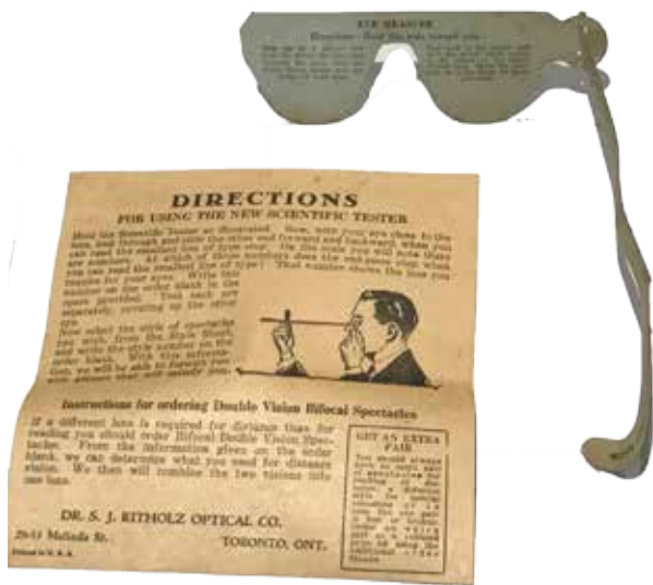
New Way Optical Company Optometer from 1920

Ian Mcallister from Perth has a wonderful collection of ophthalmic antiques. Among them is an ingenious New Way Optical Company Optometer from 1920 . This simple and cheap device was posted out. The recipient measured their reading distance and spectacle dimensions. Once mailed back, the spectacles were made to order.