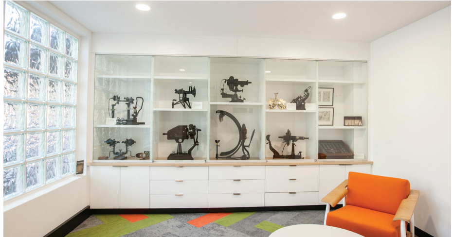
Permanent RANZCO Museum display at Chalmers Street offices