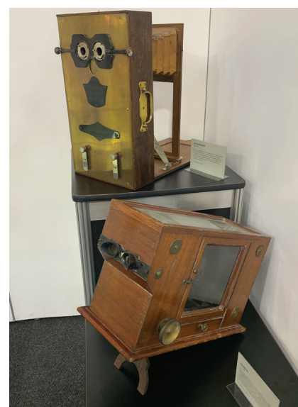
Figure 1. French 19th century autorefractors and large early versions of keratometers.

Dating into the early 20th century, ophthalmologists had to rely on remote