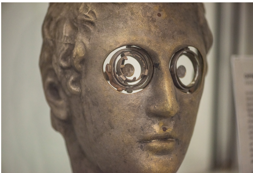
Figure 3. Phantome styled after Caesar for practicing Graefe cataract sections on pig eyes 19C.

light sources to illuminate reflecting ophthalmoscopes and retinoscopes. Prior to electric lamps, relying on candle power, a display featured the Priestly Smith lamp and early diagnostic tools with a video presentation of the 1920 consulting room.